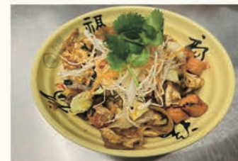
Roast cold noodles with egg and sausage 烤冷面(内含鸡蛋、火腿肠) $8.8