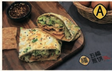
Traditional Chinese Crepe(with crispy fritter) 传统薄脆煎饼果子 $7.0