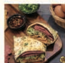
Beef Crepe 卤牛肉煎饼果子 A $10.5 B $11.5