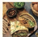
Hock Crepe 酱卤肘子肉煎饼果子 A $12.0 B $13.0