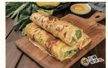
Paratha with two eggs and sausage 火腿鸡蛋灌饼(内含两颗蛋、火腿肠) $7.8