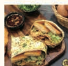
Chicken Schnitzel Crepe 炸鸡排煎饼果子 A $12.0 B $13.0