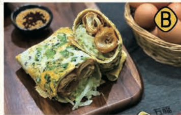
Original Crepe With Chinese Donut 原味油条煎饼果子 $8.0