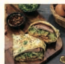
Bacon Crepe 培根煎饼果子 A $10.0 B $11.0