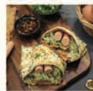
Ham Sausage Crepe 火腿肠煎饼果子 A $10.0 B $11.0