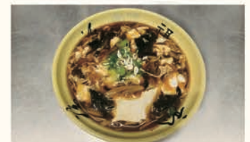
DESSERT TOFU WITH HOMEMADE SAUCE 豆腐脑 $6.8