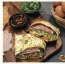
Ham Crepe 火腿煎饼果子 A $10.0 B $11.0