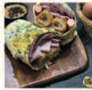
Wow Crepes Deluxe Crepe 豪华煎饼果子 A $15.5 B $16.5