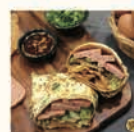
Luncheon Meat Crepe 午餐肉煎饼果子 A $10.0 B $11.0