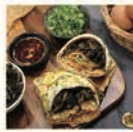
Seaweed Crepe 海带丝煎饼 A $9.5 B $10.5