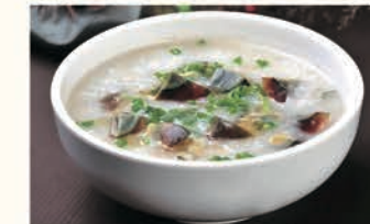
CENTURY EGG PORK CONGEE 皮蛋瘦肉粥 $6.8