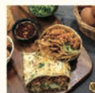
Roast Spicy Chicken Crepe 香煎鸡肉煎饼果子 A $10.0 B $11.0