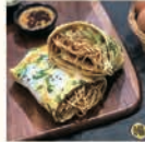
Sichuan Bean Curd Crepe 川味豆腐丝煎饼果子 A $10.0 B $11.0