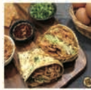
Shredded Potato Crepe 土豆丝煎饼果子 A $9.5 B $10.5