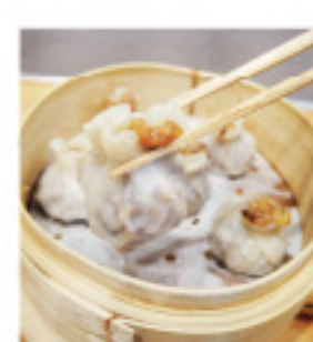
Shumai 烧卖 4p $7.8