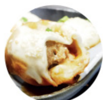
Pork Fried Bun 招牌生煎