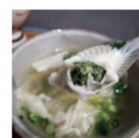
Veggie & pork Wonton 荠菜鲜肉 大馄饨 $ 12.8 Veggie & pork Wonton with Noodle soup 荠菜馄饨汤面 $ 13.3