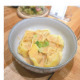
Pork & Prawn Wonton in Peanut Sauce 干捞麻酱 虾肉大馄饨 $ 13.8