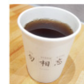
Plum Juice 酸梅汁 $ 3.2