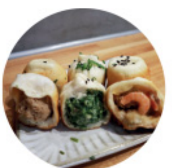
Veggie & Pork & Prawn Fried Bun