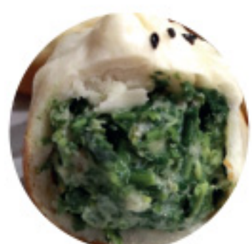
Veggie Fried Bun 荠菜生煎