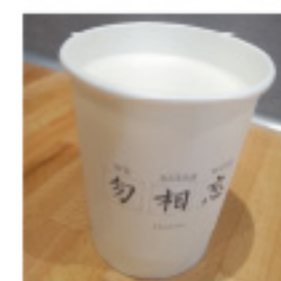
Soybean Milk 豆浆 $ 3