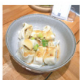
Veggie Wonton in Peanut Sauce 干捞麻酱 荠菜鲜肉 大馄饨 $ 12.8