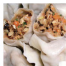
Steam / Pan fried Veggie dumpling 蒸/煎 素饺 $ 11.8