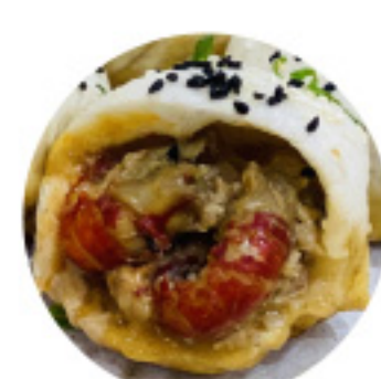
Crayfish Fried Bun 小龙虾生煎