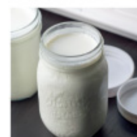
Homemade Yogurt 自制酸奶 $ 4.8