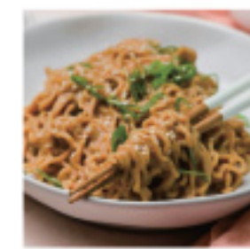
Noodle in Peanut Sauce 浓郁麻酱拌面 $ 11.8