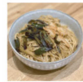
Shanghai Noodles With Dried Shrimp & Spring Onion Oil 喷香开洋葱油 拌面 $ 11.8