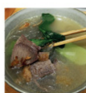
Beef Soup with Sweet Potato Noodle 牛肉粉丝汤 $7.8