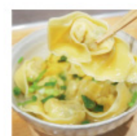
Pork & Prawn Wonton 虾肉大馄饨 $ 13.8 pork & Prawn Wonton with Noodle soup 虾肉馄饨汤面 $ 14.3