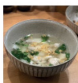
Mini Pork Wonton Soup 千里香 小馄饨 $ 11.8