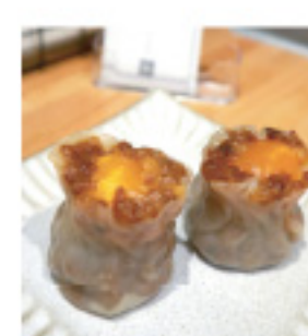
Yolk Shumai 蛋黄烧卖 2p $7.8