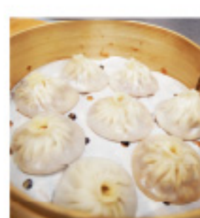
Juicy Pork Dumpling 灌汤包 8p $11.8