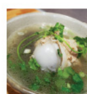
Pork Bone Soup With Sweet Potato Noodle 大骨粉丝汤 $9.8