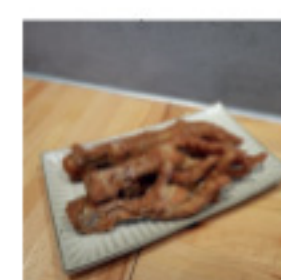
Chicken Feet 2p | 5p 魔鬼虎皮 卤鸡爪 $ 3.5 | $ 7