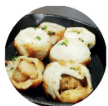
Pork & Prawn Fried Bun 双拼生煎