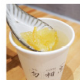
Honey Pomelo Tea 蜂蜜柚子茶 $ 3.2