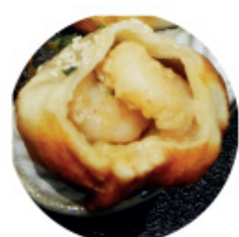
Prawn Fried Bun 大虾生煎