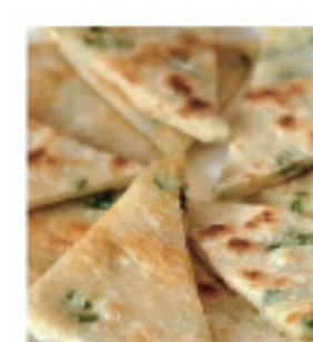
Spring Onion Pancake 葱油饼 $4.3