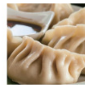
Steam / Pan fried Pork dumpling 蒸/煎 猪饺 $ 11.8