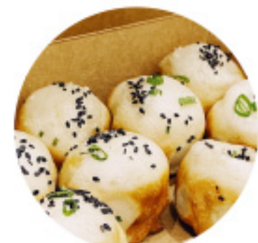
Veggie & Pork & Prawn and Crayfish Fried Bun